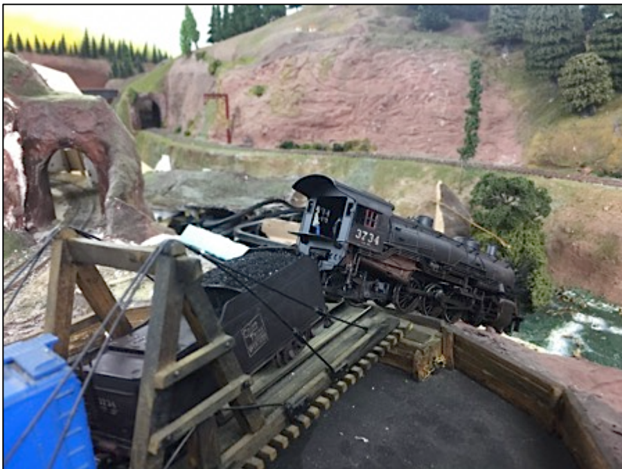
Anon. Photo by Nigel G.

recommended that consideration be given to installing a suitable stop block beyond the turntable to prevent a similar recurrence.