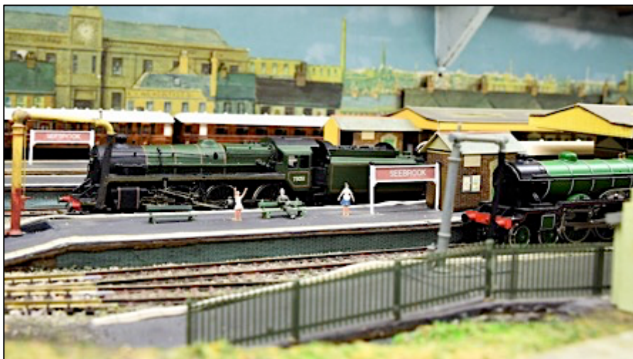
Standard 5 & B17 stop at Seabrook Station