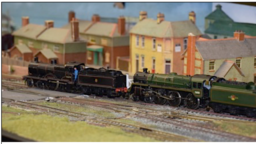
Fowler 2P pilots the Standard 5 across the level crossing at Seabrook, reminiscent of the type of power seen on the Somerset & Dorset Railway