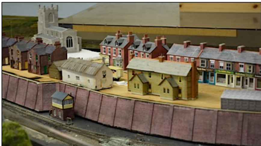
The town scene forming part of the loco shed area is slowly taking shape