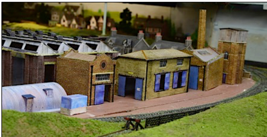
An industrial estate is being developed and squeezed into the space between the main loco shed and the approach to Binegar.